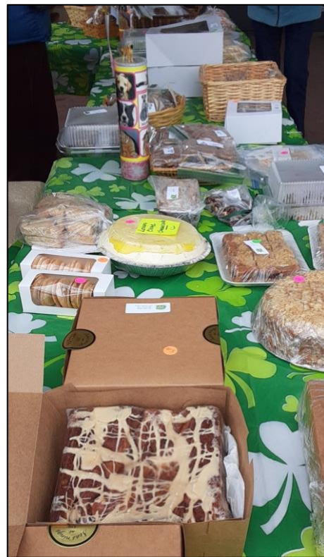
Tables of goodies await hungry customers.