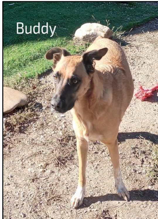
Buddy would love a female dog to guide him.