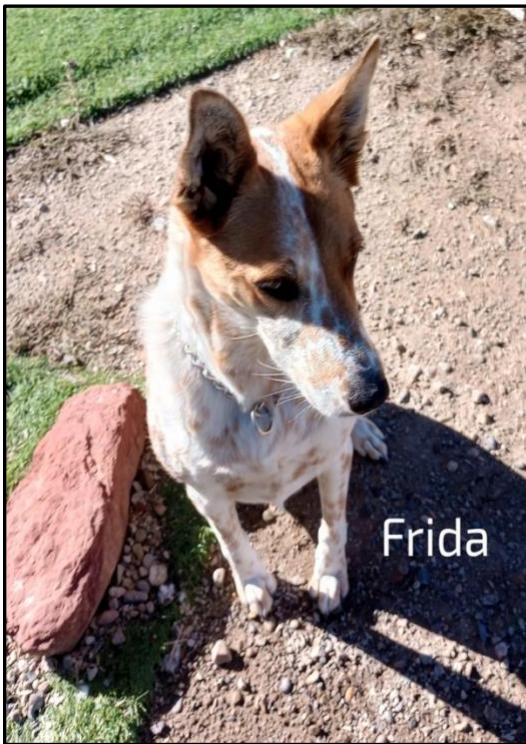
Frida loves belly rubs.

Please call the FPS hotline at 970-565-7387 for more information.