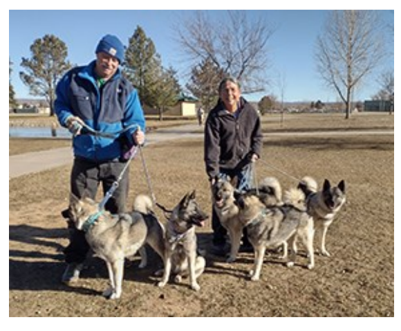
The 19th Annual CORTEZ TURKEY TROT for Pets and their People was a grand success this year!