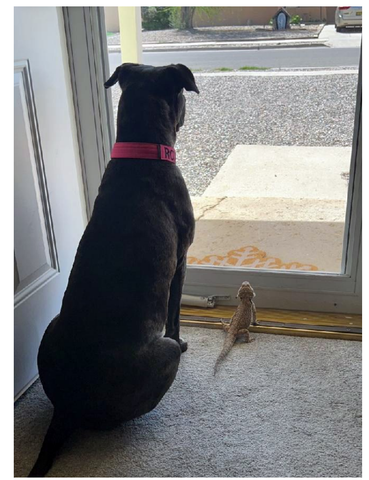
Roxy and Apollo keeping an eye on the activity on their street. . . together.