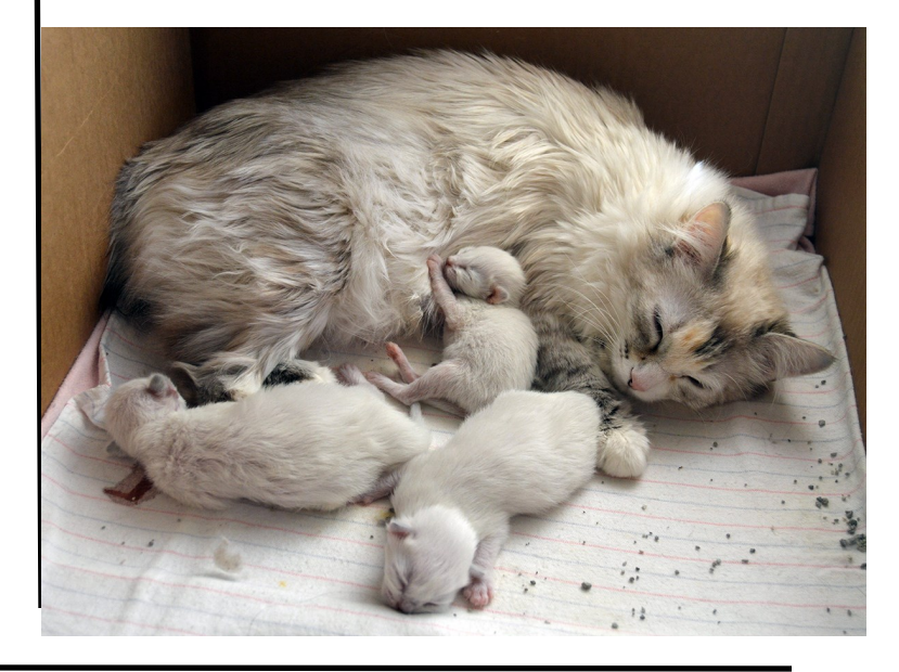
Cecilia and her flock of kittens at 5 days old.