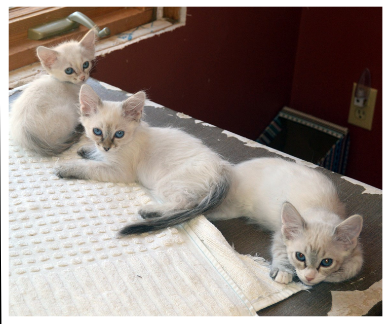
Opal, Pearl and Diamond

Things don't always work out the way we want them to. But this time we were able to make a tangible difference in both the cats' and owner's lives. That feels good. But we still have all these cats to deal with. . .