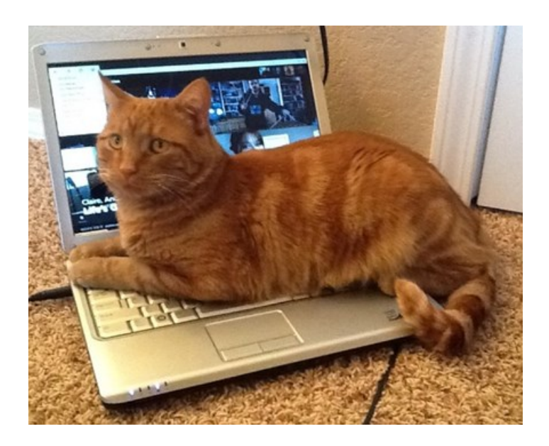
Leo at Work

Leo here. I know – taxes – ho hum. I don't have to file a tax return this year - napping in the sun and looking handsome don't pay very much. But there IS something to get excited about. I'm here to tell you about how you can help Colorado dogs and cats when you file your state tax return. If you are getting a refund, you can donate all or a portion to the Colorado Pet Overpopulation Fund or CPOF. This is a fund that gives grants to shelters, rescues and hu-mane societies to help Colorado pet owners pay spay and neuter costs for their pets. For Pets' Sake used their 2021/2022 grant to spay and neuter 283 dogs and cats in the Four Cor-ners area. Just use form DR0104CH and look for line 5 to donate. You can also go to line 17 to make a donation to a Colorado nonprofit or-ganization that you specify (of course I'm partial to For Pets' Sake Registration Number 20053004763 ). Thanks for taking time to read my article. Now, back to work - naptime!