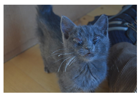
RYAN (He didn't end up blind, though we thought he was when we rescued him.)