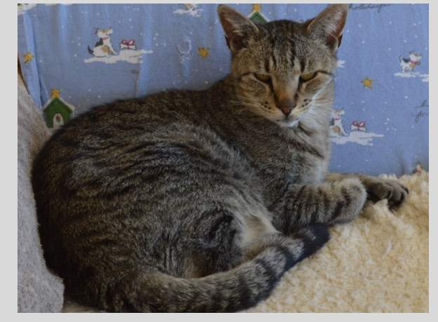
Tigger, a previous FPS foster and survivor of panleukopenia

There is a highly effective and safe vaccine that is part of the core vaccine series for cats and kittens and is the surest way to prevent this potentially fatal virus. Annual boosters must be repeated to maintain effective immunity. Pet owners should consult with their veterinarian for advice on vaccination schedules.