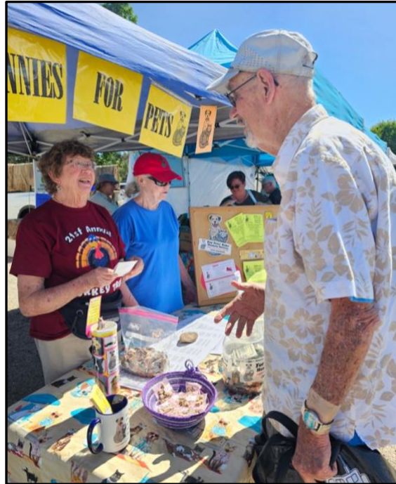
Pennies for Pets at the Dolores (left) and Cortez Farmers Markets.

August is National Dog Month. Time to Celebrate!