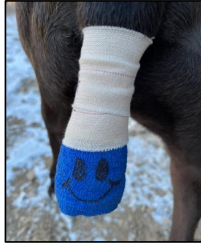
Max and his "happy tail" before (left) and after surgery.