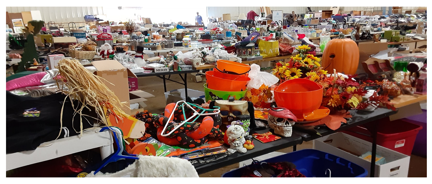
Beef Barn stuffed with bargains on Day 1 of the 2023 HUGE Yard Sale