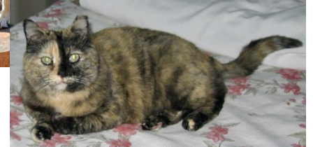
Pet Member Mindy