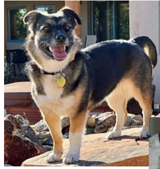
Pet Member Yahzee (Little One)