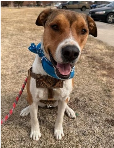
FPS Foster Dog River