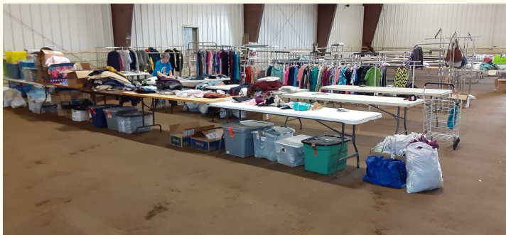
Tuesday — Donation Day