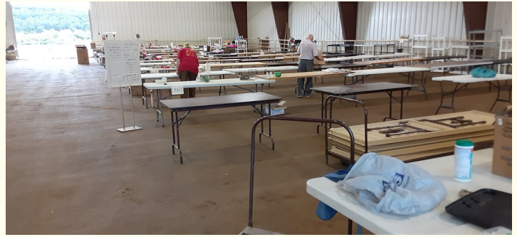
Monday — Set Up Tables