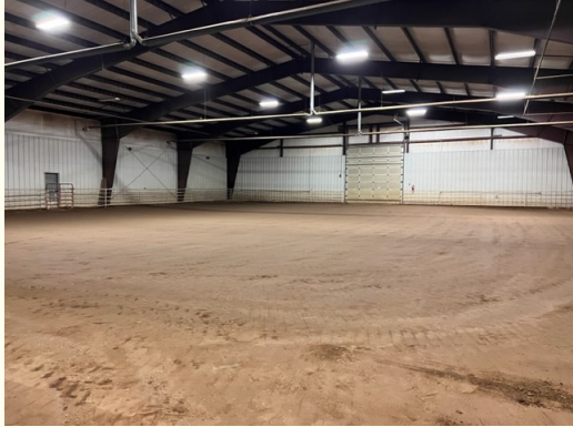
Monday — Beef Barn 10am