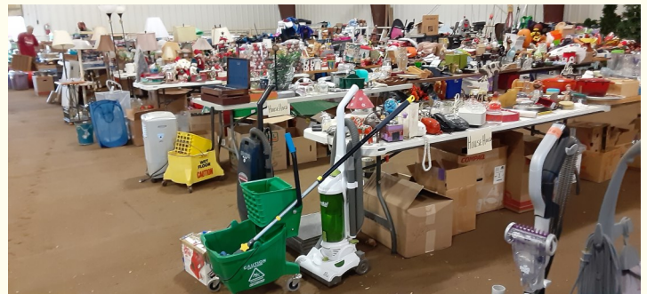
Wednesday — Stuffed to the Rafters with Donations