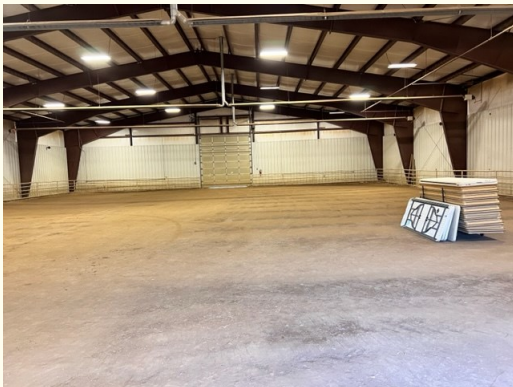
Sunday — Beef Barn 6pm — All Done!