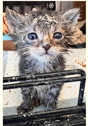
Pam's Weston After Lunch