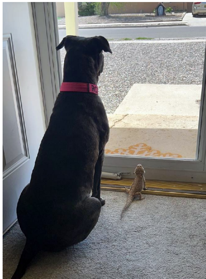
Roxy and Apollo keeping an eye on the activity on their street. . . together.