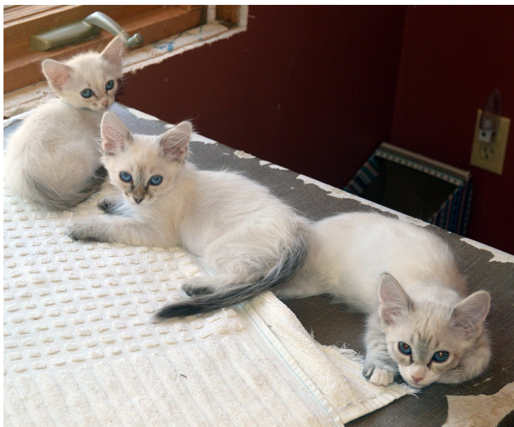
Opal, Pearl and Diamond

Things don't always work out the way we want them to. But this time we were able to make a tangible difference in both the cats' and owner's lives. That feels good. But we still have all these cats to deal with. . .