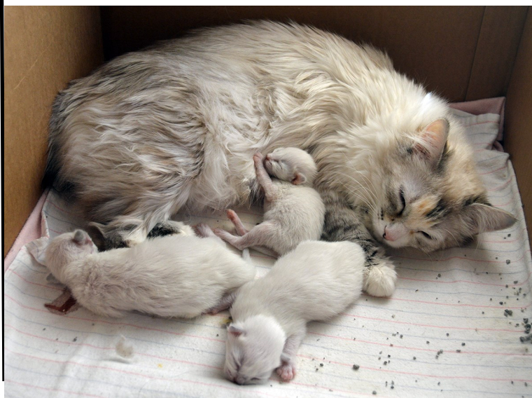
Cecilia and her flock of kittens at 5 days old.