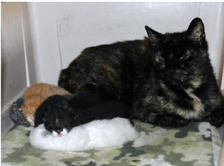
Polly and her flock of kittens at 6 days