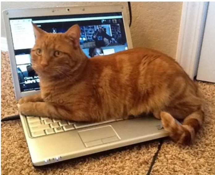
Leo at Work

Leo here. I know – taxes – ho hum. I don't have to file a tax return this year – napping in the sun and looking handsome don't pay very much. But there IS something to get excited about. I'm here to tell you about how you can help Colorado dogs and cats when you file your state tax return. If you are getting a refund, you can donate all or a portion to the Colorado Pet Overpopulation Fund or CPOF. This is a fund that gives grants to shelters, rescues and hu-mane societies to help Colorado pet owners pay spay and neuter costs for their pets. For Pets' Sake used their 2021/2022 grant to spay and neuter 283 dogs and cats in the Four Cor-ners area. Just use form DR0104CH and look for line 5 to donate. You can also go to line 17 to make a donation to a Colorado nonprofit or-ganization that you specify (of course I'm partial to For Pets' Sake Registration Number 20053004763 ). Thanks for taking time to read my article. Now, back to work - napttime!