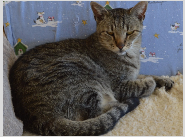
Tigger, a previous FPS foster and survivor of panleukopenia

There is a highly effective and safe vaccine that is part of the core vaccine series for cats and kittens and is the surest way to prevent this potentially fatal virus. Annual boosters must be repeated to maintain effective immunity. Pet owners should consult with their veterinarian for advice on vaccination schedules.