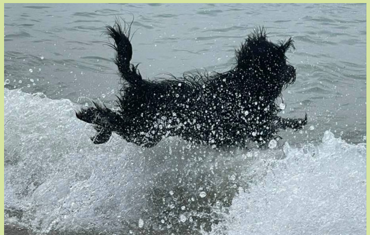
Walter's New Life